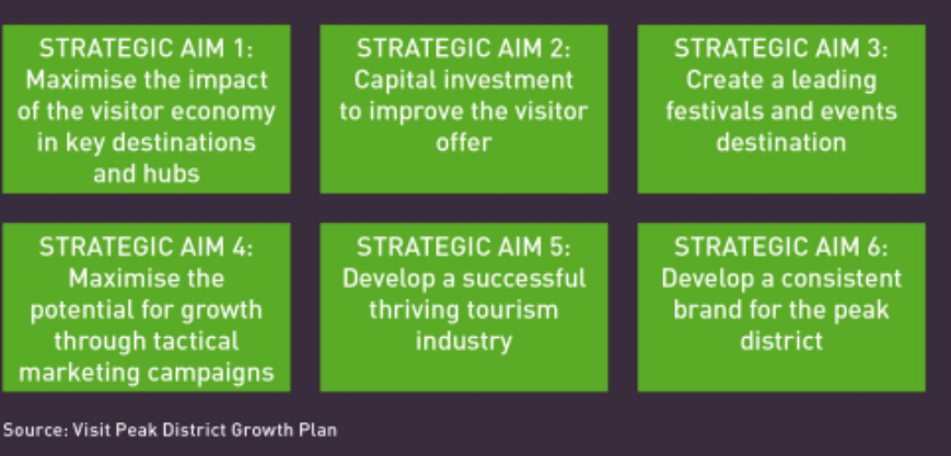
FIG 10: TOP PRIORITIES

5.1.5 These priorities are shaping future strategy and action for the development of the visitor economy across the two counties, and forming the basis for funding bids, both in terms of accessing resources from Local Growth Fund and also other sources. Visit Peak