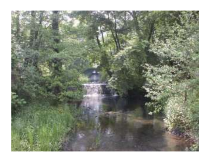
Route length - 12 Miles

Produced by the Burton Group of the Cyclists' Touring Club, Derby Section