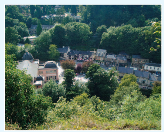
The view down to Matlock Bath

Follow this path alongside the river until you go under the railway bridge and then keep left to leave the riverbank. When you reach two bridges - one on your right going over the river and one on your left going under railway, turn left and go under the bridge and follow the path uphill. Just before you reach the first house on the right, turn sharp right and go through the gateway into the High Tor grounds.