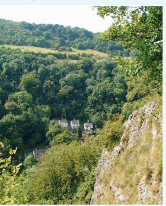
The view from near Giddy Edge

As you leave the park continue straight ahead onto a road called Knowleston Place. Look for a signpost that directs you to the right, over a small bridge into Pic Tor Park. Follow the path that runs between the cliffs and the river, which is known as The Promenade.