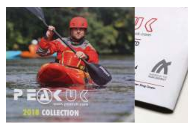
Peak UK using the logo on their brochure.

These businesses, all inspired in their own way, bring business to the area and play an important part in growing the local economy.