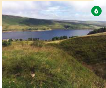
6. Widdop Reservoir (Pennine National Trails Partnership)