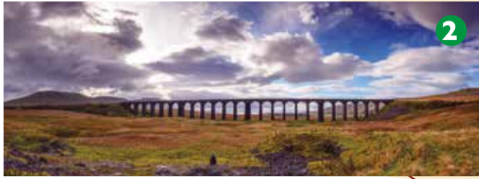
2. Ribblehead viaduct