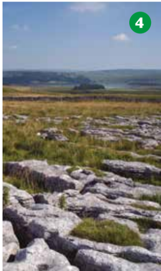
4. View to Malham Tarn from the Settle Loop (YDNPA)