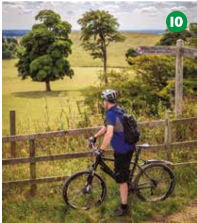
10. High Peak Trail (Derbyshire County Council)