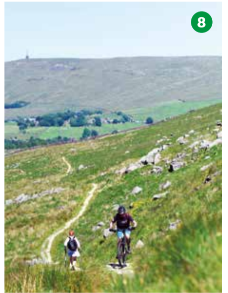
8. View to Stoodley Pike (Joolze Dymond)