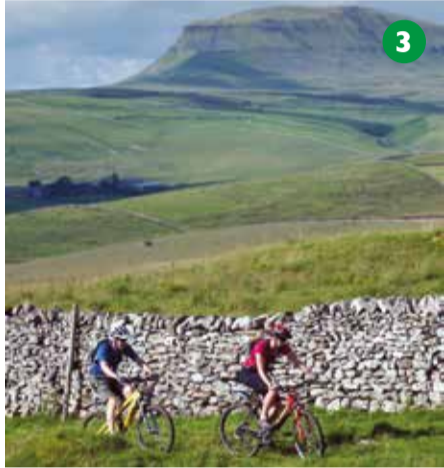
3. View to Penyghent (YDNPA)