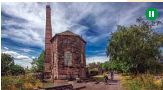
11. Middleton Top Chimney (Derbyshire County Council)