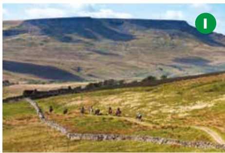
1. Wild Boar Fell (YDNPA)