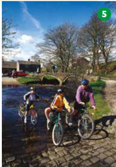
5. Wycoller Country Park (Natural England)