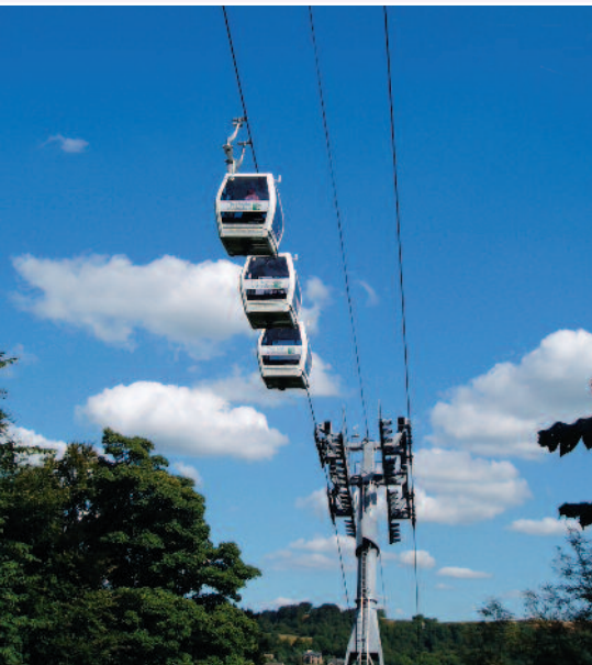
Cable cars to the Heights of Abraham

Cross the railway bridge and turn right into Snitterton Road. Turn left at the bottom, then right over the road crossing and continue ahead over the river bridge towards Crown Square and Matlock Tourist Information Centre.