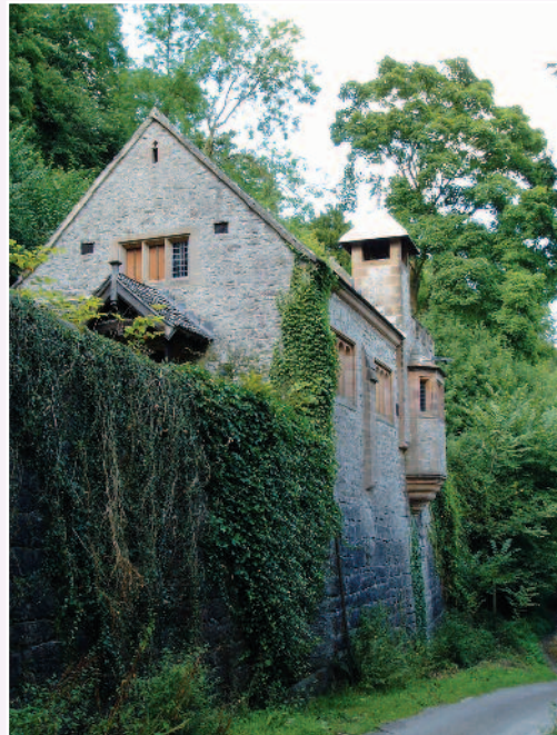
St John's Chapel