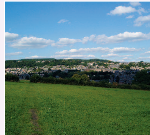
Great views of Matlock