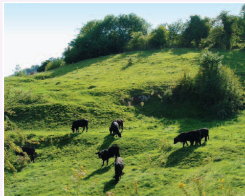
En-route to Matlock