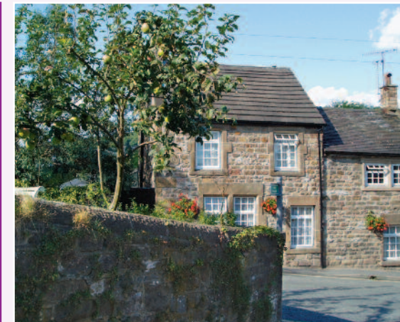
The route joins Snitterton Road